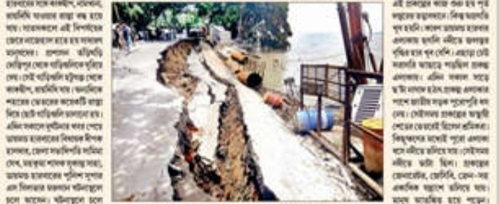
ডায়মন্ড হারবারের ডায়মন্ড সড়কে ধস।

পৌরস্বত্ব মঙ্গল ডায়মন্ড হারবার, ১ জানুয়ারি ডায়মন্ড হারবারে ১১.৫ কিলোমিটার দৈর্ঘ্যের ৩০০-পুষ্টি বেদি একেবারে ধসে যায়